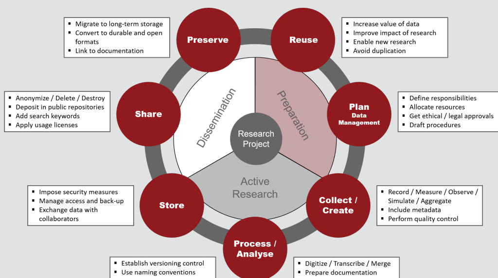
FIGURE 1. THE RESEARCH DATA LIFECYCLE, ILLUSTRATING DIFFERENT ASPECTS OF RESEARCH DATA MANAGEMENT THROUGHOUT THE COURSE OF A RESEARCH PROJECT

In the rest of this chapter, we will take a closer look at some of the main actions taken to manage research data. The chapter is structured according to the ‘research data lifecycle’, which illustrates the typical phases of a research project, shown below in Figure 1. In short, we will discuss how to best plan your research data management, how to collect, process, store and secure your research data during the active phase of the research project, whether and how to share your data with others after your project has concluded, what to consider when preserving research data, and what documentation to generate and maintain along the way. The aim of this chapter is to outline general norms of good research data management and to discuss the ways in which these norms can be implemented across disciplines.